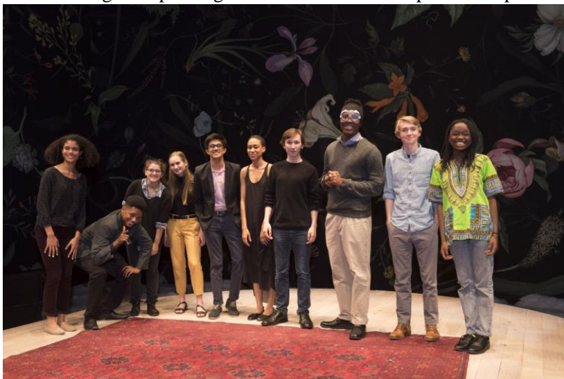
The ten finalists chosen from among 55 semi-finalist competitors at the 2017 English-Speaking Union National Shakespeare Competition.