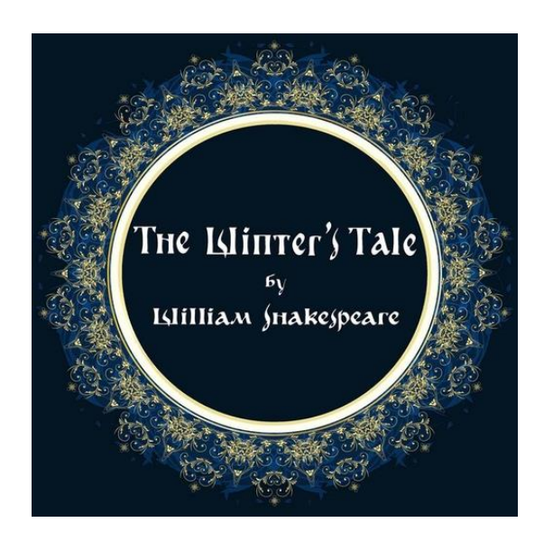
The Winter's Tale Saturday, August 5, 7:00pm

Look for Reservation Details at a later date