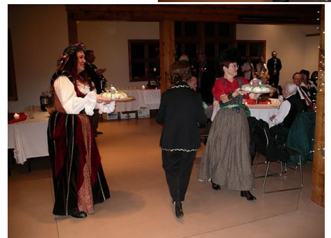
Photographs from Twelfth Night, 2010