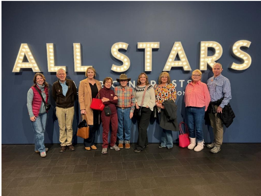
Denver Branch Members at the DAM All Stars Exhibit

This collection featured works by more than 50 artists including Benny Andrews, Arthur G. Dove, Childe Hassam, Jacob Lawrence, Georgia O'Keeffe, Jackson Pollock, and more.