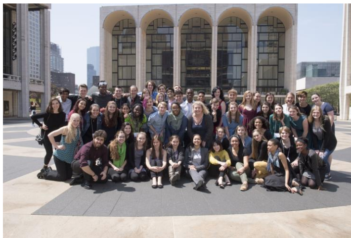
The 54 semi-finalists at the 2017 English-Speaking Union National Shakespeare Competition in New York City.